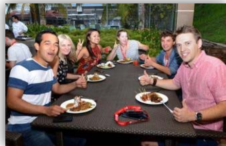
Make friends from all over the world

Ranked among the top 1% of universities worldwide, NTU places you in an academically stimulating environment that is both culturally and socially enriching. Our comprehensive and innovative approach towards education and research will help contribute to your future success and inspire you to realise your full potential as an entrepreneurial and technologically-savvy leader.