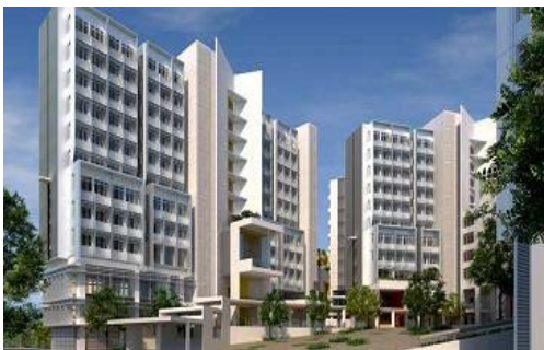
NTU Hall of Residence