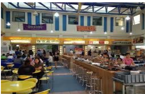
Hall of Residence Canteen